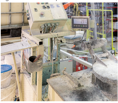
Figure 1: Production process detail

The production process starts from raw materials, that are purchased from external and intercompany suppliers and stored in the plant. Bulk raw materials are stored in specific tanks and added in the production mixer, according to the formula of the product. Other raw materials, supplied in bags, tanks, drums and cans, are stored in the warehouse and added manually in the mixer. The production is a discontinuous process, in which all the components are mechanically mixed in batches. The semi-finished product is then filled in IBC, drums, buckets or cans, put on wooden pallets and stored in the finished products warehouse. The quality of final products is controlled before the sale.